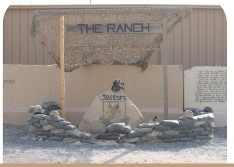
Summer 2006, Iraq